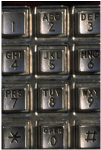
Caption describing picture or graphic.