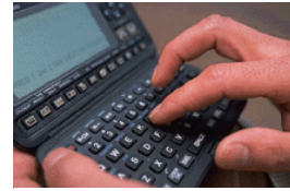
Caption describing picture or graphic.

veniam, quis nostrud exerci taion ullamcorper suscipit lobortis nisl ut aliquip ex en commodo consequat. Duis te feugifacilisi per suscipit lobortis nisl ut aliquip